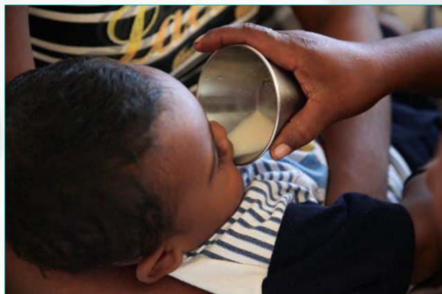
A child of ~20 months being given a 500-mg mebendazole tablet crushed with water in Madagascar, 2006

This dramatic rise in coverage has taken place despite the fact that practical field guidelines, which exist for school-age children, have not yet been produced for the younger age group.