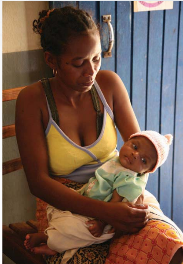
An infant under 12 months of age in Madagascar, 2006

CHILDREN UNDER 12 MONTHS OF AGE SHOULD NOT BE TREATED