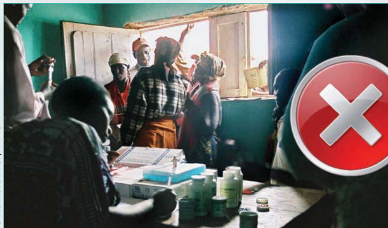
A health post in Rwanda with very little space. Children are being passed over the heads of the waiting crowd, 2006

Triage + register child → vitamin A → deworming tablet → measles/injectable → insecticide-treated bednet