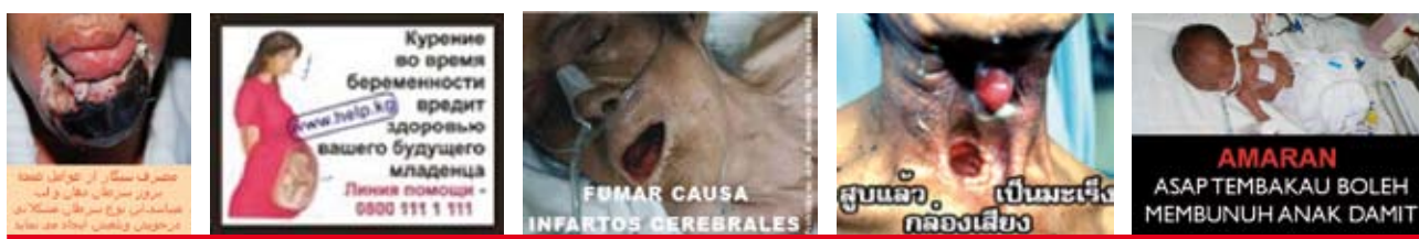
Picture warnings from Iran, Kyrgyzstan, Peru, Thailand and Brunei Darussalam

More and more countries are requiring pictorial warnings on tobacco packaging. As of 31 May 2009, 23 jurisdictions with a combined population of nearly 700 million require large graphic health warnings on packaging. Several others – Djibouti, Mauritius, Latvia and Switzerland – have finalized legislation to implement pictorial warnings later in 2009 and in 2010.