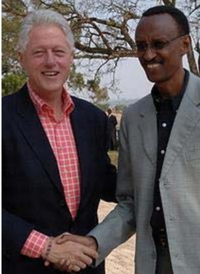
Rwandan President Paul Kagame welcomes Former President Bill Clinton to Rwanda in July 2006.

Rwandan President Paul Kagame unveiled his country's first national conservation park to promote reforestation and conservation, and research to enhance knowledge of the world's diminishing number of great apes.