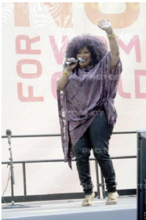
September 26, 2007. New York City.....Singer Chaka Khan performs at the kickoff at Bryant Park in New York City.....Deliver Now is a major new advocacy drive to eliminate maternal and child deaths and improve the health of women and children around the world Ref: B434_105551_0001 Date: 26.09.2007

Chaka Khan performed at the kickoff at Bryant Park in New York City for Deliver Now on Wednesday (September 26), a major new advocacy drive to eliminate maternal and child deaths and improve the health of women and children around the world. Check out pictures from Photoshot .