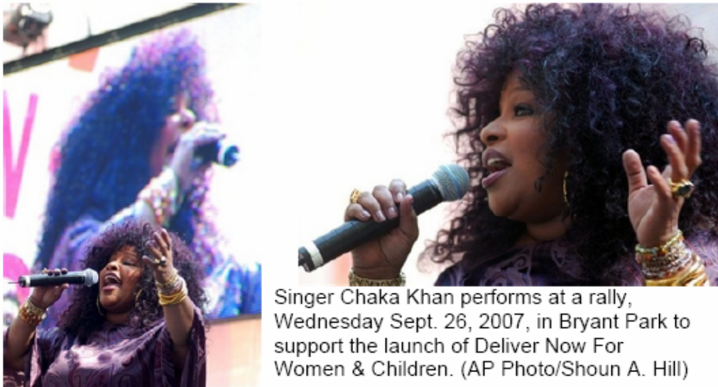
Singer Chaka Khan performs at a rally, Wednesday Sept. 26, 2007, in Bryant Park to support the launch of Deliver Now For Women & Children.