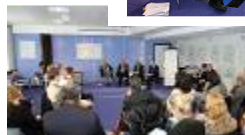
Session with Patient Safety Experts Inaugural PFPS Workshop November 2005