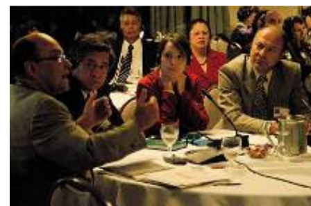
PFPS PAHO Regional Workshop, San Francisco USA, May 2006