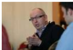
Patient Champions in discussion at PFPS programme strategy meeting