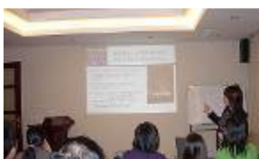
PFPS Global Champion, China Presenting on PFPS: 4 th Asian-Pacific Conference on Evidence –based Medicine