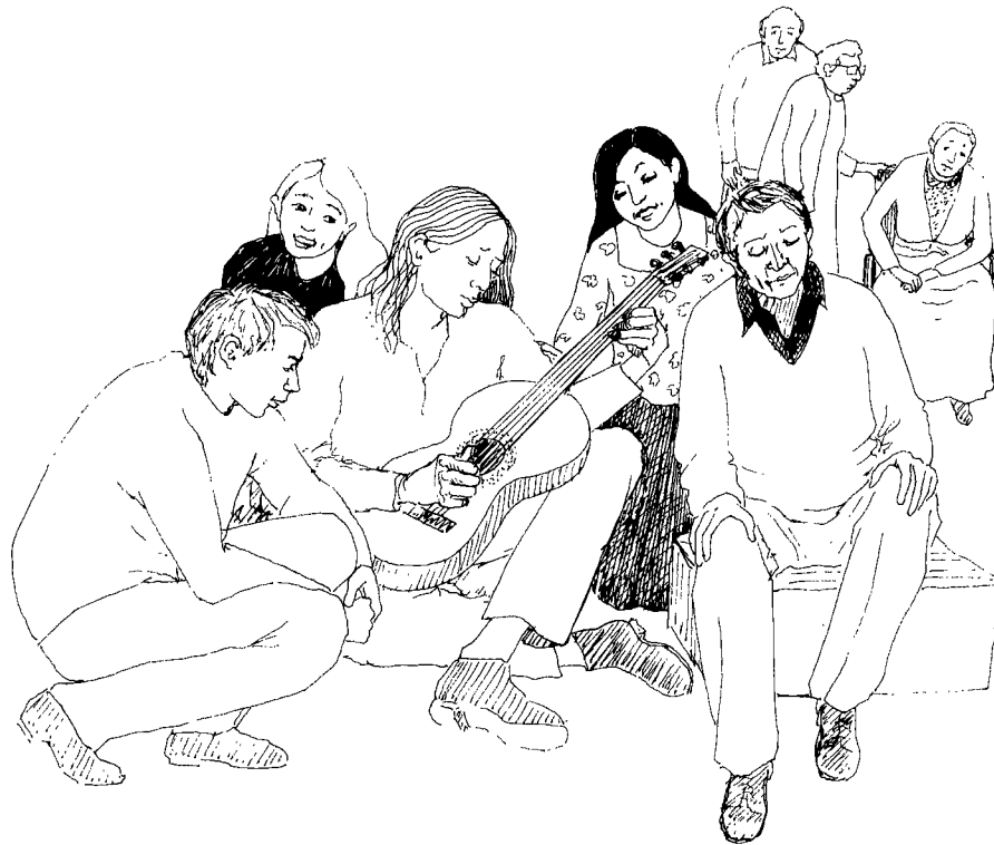
Singing together is a way of reducing stress

Normal communities have social activities that help reduce stress. These include music, dancing, singing, celebrations and sports. They allow people to meet together and be happy together. It is very healthy to enjoy oneself. Even with poor living conditions and plenty of reasons for sadness, such social events should be encouraged. No one should be lost in sadness all the time.