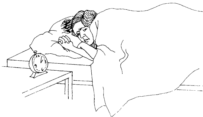
People with stress often have trouble falling asleep

People should, however, associate their bed with the idea of sleep. Therefore a person who has not gone off to sleep after half an hour should get up for a while and wait until feeling sleepy again, and then go back to bed. If the person is still awake after another half an hour, he or she should get up and repeat the procedure.