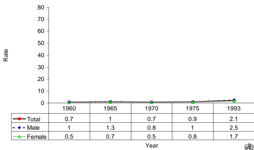
Suicide rates (per 100,000), by gender and age, Philippines, 1993.