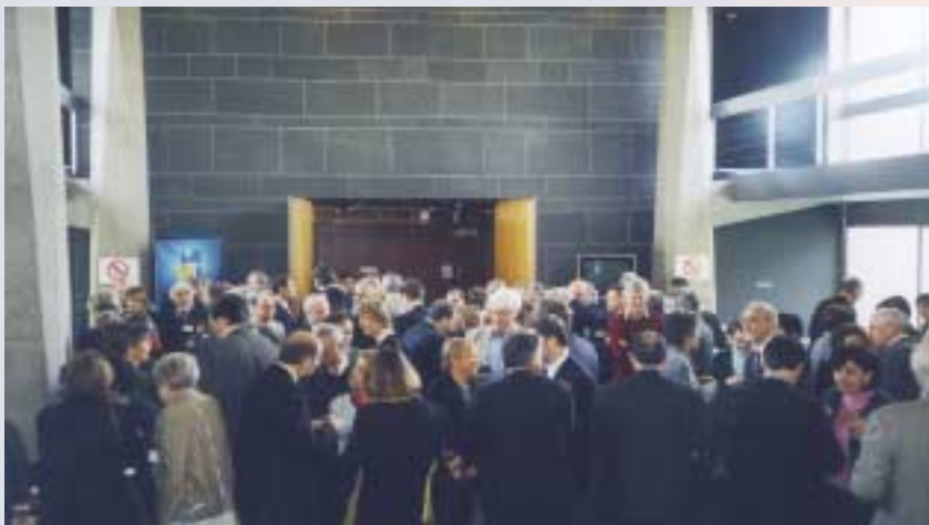
Participants of the Launch continue discussions during the coffee break.