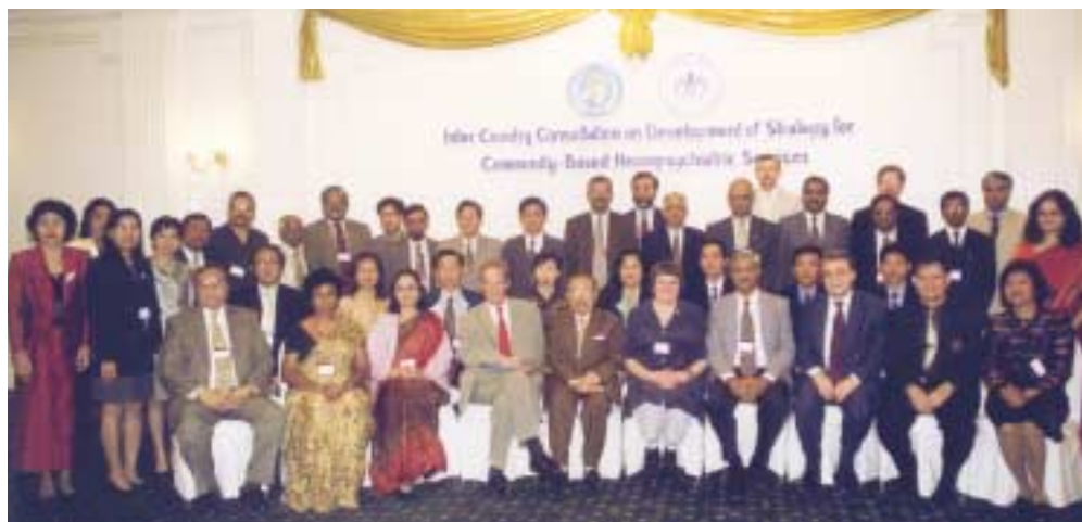
Participants of the Intercountry Consultation