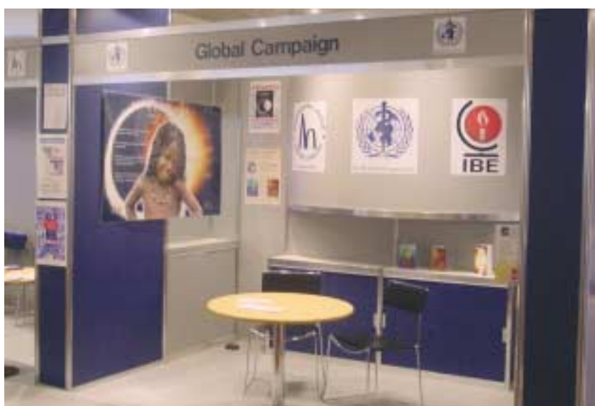
Campaign stand at the 24th International Epilepsy Congress, Buenos Aires, Argentina.

A special section on "future congresses", which is a recurring feature in every issue of the newsletter, highlights those epilepsy congresses that will have a programme session dedicated to the Global Campaign against Epilepsy.