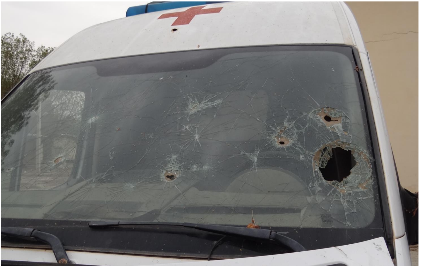
The wreckage of an ambulance repeatedly attacked at Bentiu Hospital now sits immobilized beyond repair