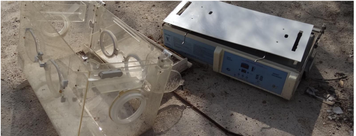
An incubator, intended to help premature babies, destroyed during an attack on Bentiu Hospital in April 2014.