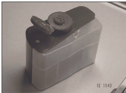
Figure 3: BD hub cutter

There is experience with the new introduction of the Beckton Dickinson (BD) hub cutter in immunization services in China. A total of 10 000 units have been introduced since 2003 (they were sold together with auto-disable syringes). A controlled study in Tianjing is being conducted to assess user acceptability but not safety. Full results are not available because of disruptions secondary to the SARS outbreak. Preliminary assessments were held at over 20 immunization safe injection seminars, where user feedback was favourable overall.