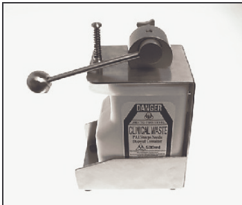
Figure 2: Nomoresharps backback model ®

PATH coordinated workshop / focus groups during which needle removers were presented and discussed. Balcan ® devices were introduced in about 150 health centres as well as protected needle pits at each centre. A several page training guide was developed and distributed. A 1/2 day orientation on how to use them correctly was added on to routine coordination meetings. No formal evaluation has been done. Reports exist that they are being used consistently. No acceptability problems have been reported.