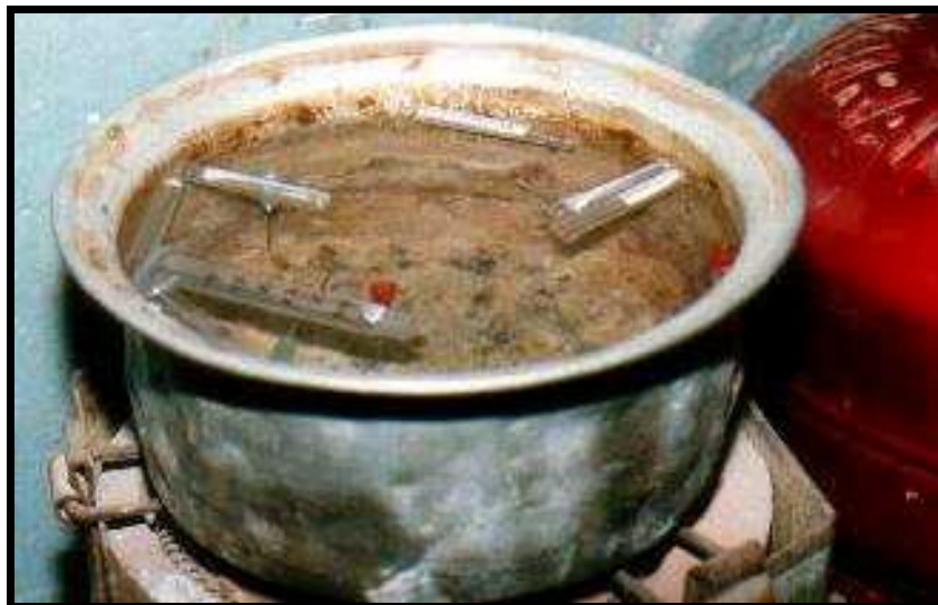
Disposable syringes and needles waiting to be re-used without sterilization in a pot of tepid water, Asia, February 2000.