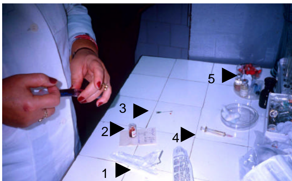
Figure 3. Injection preparation table in a Romanian hospital, 1998. Breaks in injection safety that may account for HBV transmission through injections in the absence of re-use of syringes and needles include preparation of injections (1) on a table where open blood samples are handled (2), bloody needles (3) and used syringes (4) are abandoned, and needles are left in multi-dose vials (5).