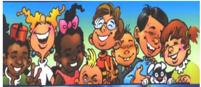
HEALTH IS A FUNDAMENTAL HUMAN RIGHT