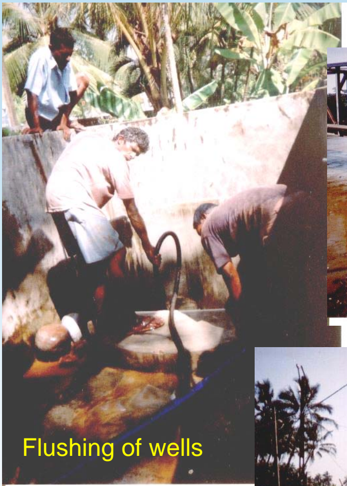
Flushing of wells