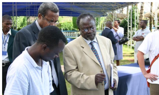
Prof. Tarsis Kabwegyere, Minister of Disaster Preparedness and the Humanitarian Coordinator Mr. Theophane Nikyema inspect stalls of exhibiting clusters during 2008 CAP launch.

The humanitarian community, in cooperation with national and district – level government authorities, has developed the CAP 2008 as a combination of humanitarian and recovery programming that contributes to achievement of the strategic objectives identified within the Peace, Recovery and Development Plan (PRDP) for northern Uganda in order to ensure a smooth transition from crisis to recovery. The Consolidated Appeals Process is the principle