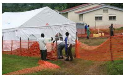
The Ebola isolation unit in Bundibugyo hospital

To support case management, two isolation facilities were established in Kikyo health centre IV (which is the epi-centre of the outbreak) and Bundiguyo hospital while the existing isolation unit in Mulago hospital, Kampala was reactivated to ensure prompt and effective treatment of patients using the best infection control procedure available. Given that the disease is transferred from person-to-person and that most of the cases of the disease cluster around patients and health workers treating them, infection control