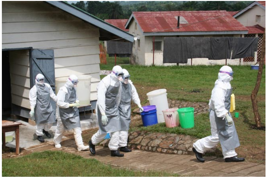
A technical team visits the Ebola isolation unit in Bundibugyo Hospital.

Bundibugyo, a very rural, underdeveloped, and mountainous district of western Uganda has been hit by an epidemic of Ebola viral hemorrhagic fever. Ebola is a very infectious and deadly viral hemorrhagic fever caused by a virus belonging to the filoviridae family.