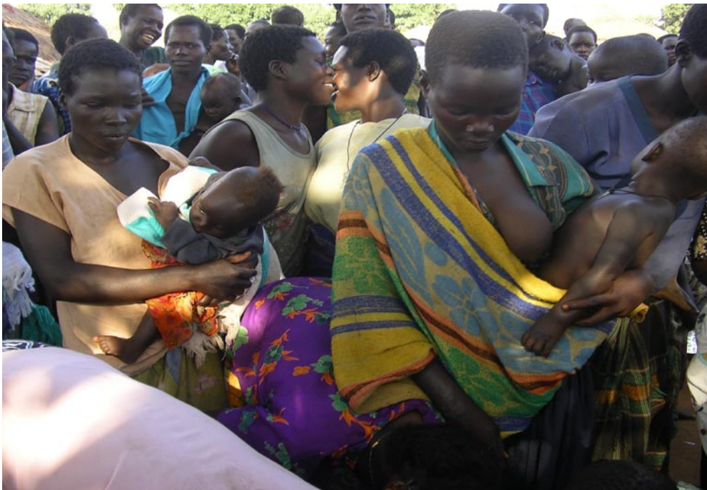
Young mothers attend a mobilisation activity

The precarious situation in which many adolescents grow up in the Internally Displaced People's (IDP) camps and return area of northern Uganda contributes to risky behaviours such as; alcoholism, drug abuse, domestic violence, sexual abuse and prostitution. This predisposes the young population in the north and north-eastern Uganda highly vulnerable to STDs/HIV/AIDS and unintended pregnancies among others.