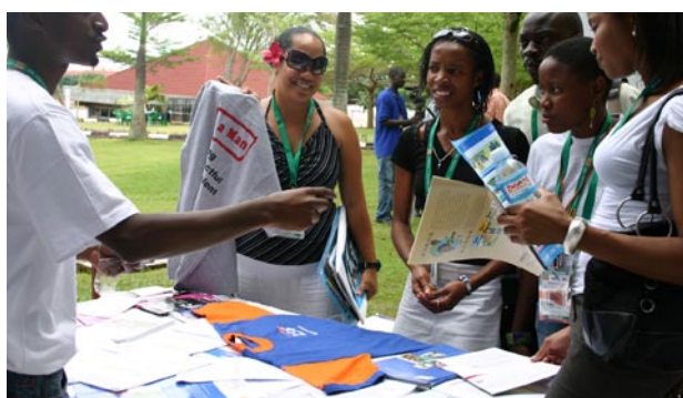
Youths consult at the UN exhibition stall.

Despite it being a Commonwealth forum for young people, it was attended by representatives from 42 countries out of 52, which signifies that youths' contribution is highly valued. ■