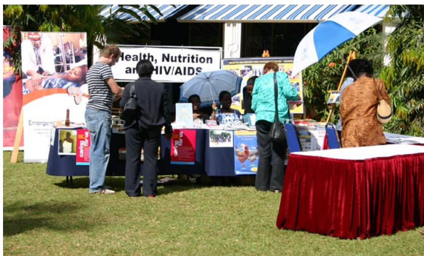
Health, Nutrition and HIV/AIDS cluster exhibit during the 2008 CAP launch

The Government and humanitarian community in Uganda on 10th December 2007 launched the 2008 Consolidated Appeal for Uganda (CAP 2008), which seeks US$ 373,943,491 to address emergency life saving needs and facilitate the recovery of vulnerable groups, including displaced and formerly displaced populations, refugees and those affected by natural hazards in Acholi, Lango, Teso, and Karamoja regions.