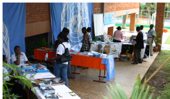
Some of the exhibition stalls at the Commonwealth Youth Forum.

The outgoing Secretary General to the Commonwealth, Rt. Hon. Don Mckinnon, said that the Youth Forum