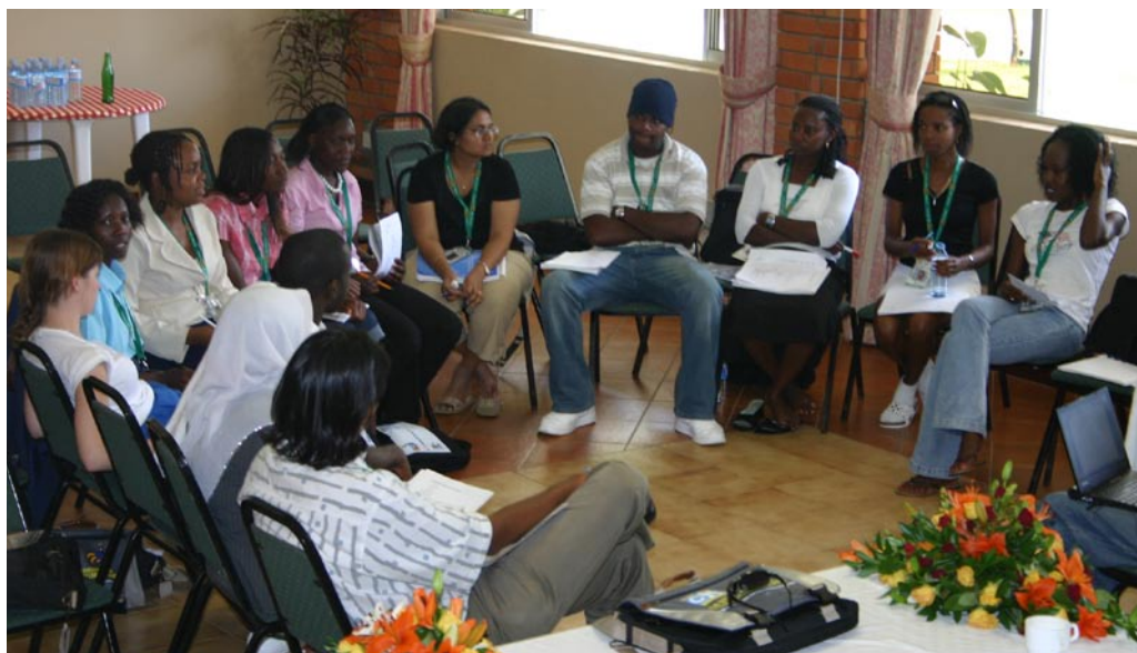
Youths from Commonwealth countries meet during the youth forum at Imperial Botanical hotel in Kampala

The Commonwealth Youth Forum, 2007 (CYF), which was hosted by Uganda between 13 to 20th November 2007 provided an opportunity to enhance young people's potential for development.