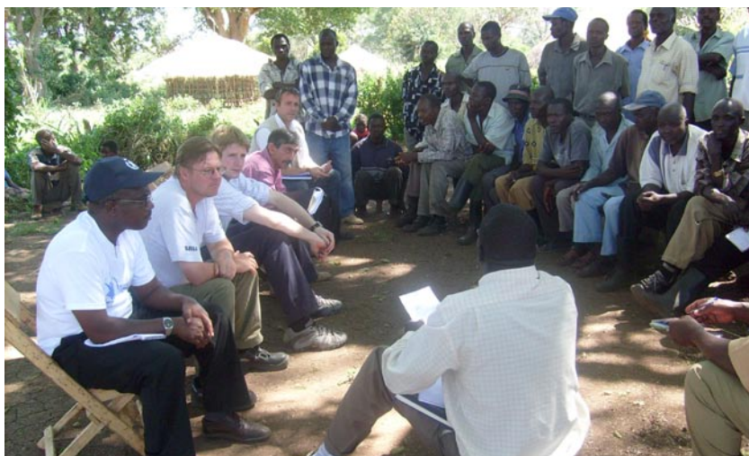
Joint effort: Cluster members from UNOCHA, UNICEF, WFP, PILGRIM and WHO assess the health situation in Ngenge subcounty, Kapchorwa district, one of the villages that were cut off due to floods.

Unusually heavy rains in the northern, eastern and north eastern regions of Uganda starting from August to November 2007 resulted in the heavy flooding in these areas.