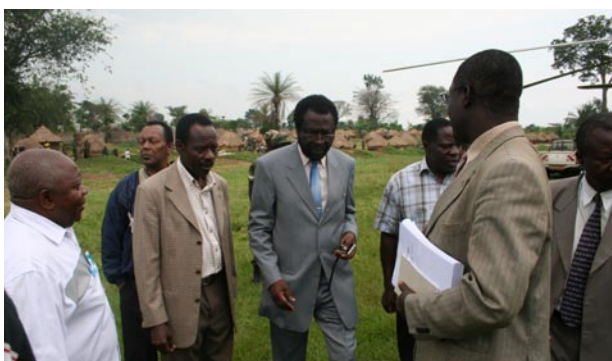
Ministry of Health officials visit Bundibugyo district to assess the ebola situation.

through its Ministry of Health (MOH) officially declared an epidemic of the disease on the 29th of November 2007. A comprehensive epidemic response which focused on establishing infection control at the health facility and community levels, prompt identification of cases and their contacts, establishment of appropriate isolation facilities and effective treatment, community mobilization and education about the disease was immediately mounted in the district.