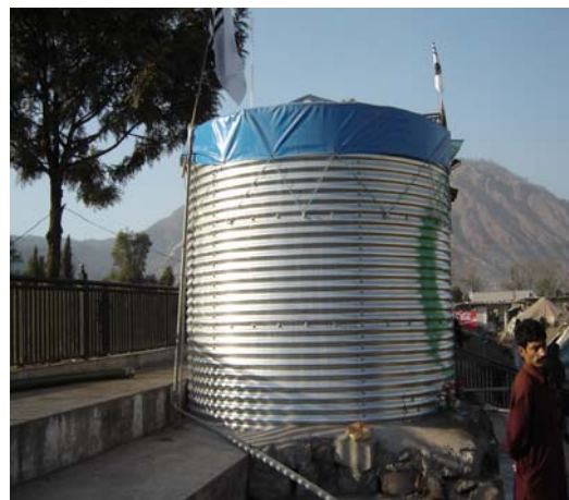
Water tank at rehydration treatment centre in Muzaffarabad.