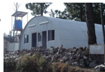
Newly constructed prefabricated basic health unit in Anwar Sharif, Muzaffarabad

The Bahrain Red Crescent Society will be reconstructing two schools, a university college, an orphanage and a medical centre in the earthquake affected areas.