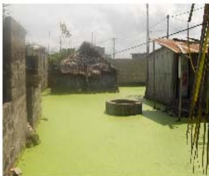
Floods in Benin, (Photo: Archives WHO Benin)