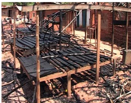
Horror in Dongo, Province of Equateur/DRC: market place and houses burnt down