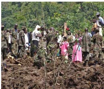
Ugandan troops and villagers search where a landslide buried an entire village