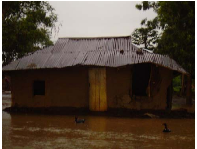
Many houses are at risk of collapse