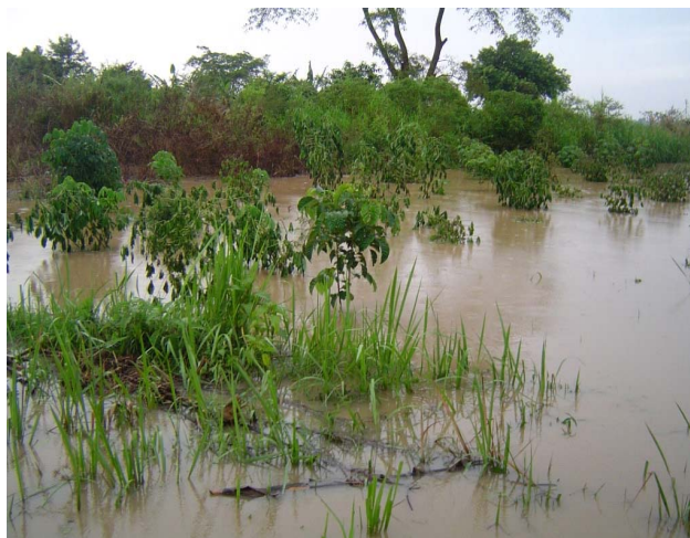
Farm land with cassava submerged with flood