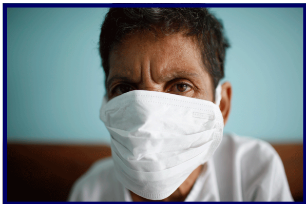
TB patient receives treatment, - WHO/Jean Chung

Tuberculosis (TB) prevention, care and control raise important ethical and policy issues that need to be adequately addressed. These concerns have been accentuated by the problem of Multi-Drug Resistant TB (MDR-TB) and, most recently, by the emergence and spread of Extensively Drug Resistant TB (XDR-TB), which is especially difficult to detect and treat.