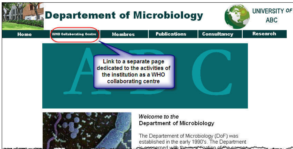
Example above: main page of the Department of Microbiology of the University ABC.