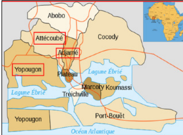
Affected areas of Abidjan (February 2011)