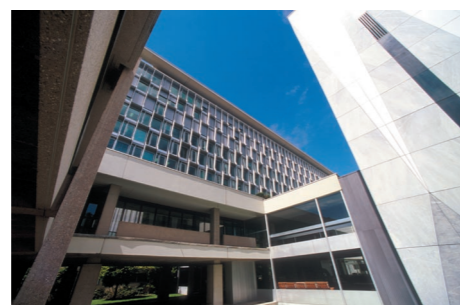
World Health Organization headquarters, Geneva

The capacity of virtually all cardiovascular disease control organizations is inadequate to meet the challenge of the CVD epidemic.