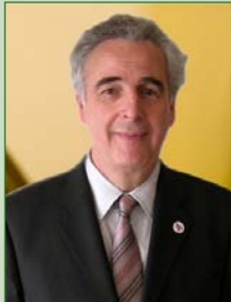
Dr Michel Kazatchkine

Dr Michel Kazatchkine was recently appointed executive director of the Global Fund to Fight AIDS, Tuberculosis and Malaria. He has treated people with AIDS for more than 20 years and been co-author of more than 600 research papers. From 1998 to 2005, Kazatchkine was director of France's National Agency for AIDS Research (ANRS), the world's second-largest AIDS research programme. He formerly served as France's envoy for HIV/AIDS and communicable diseases. Kazatchkine was the first chair of the Global Fund Technical Review Panel, which assesses the quality of grant proposals.