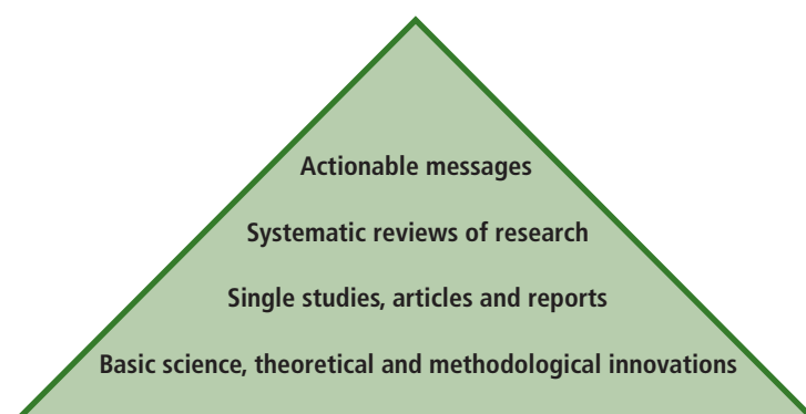
Fig. 1. Knowledge pyramid 1,26

While actionable messages arising from systematic reviews may be the natural unit of research to consider when attempting to link research to action, people are still needed to make these links. Four approaches can be employed, either singly or in combination, to link research to action (Fig. 2). 1,26 “Push” efforts are led by researchers, intermediary groups and other purveyors of research (such as communications staff). 27 Such efforts are well suited to situations where the potential research users are unaware that they should be considering a particular message (or in some cases would prefer to continue to disregard it). “User-pull” efforts involve patients, health-care professionals, civil servants