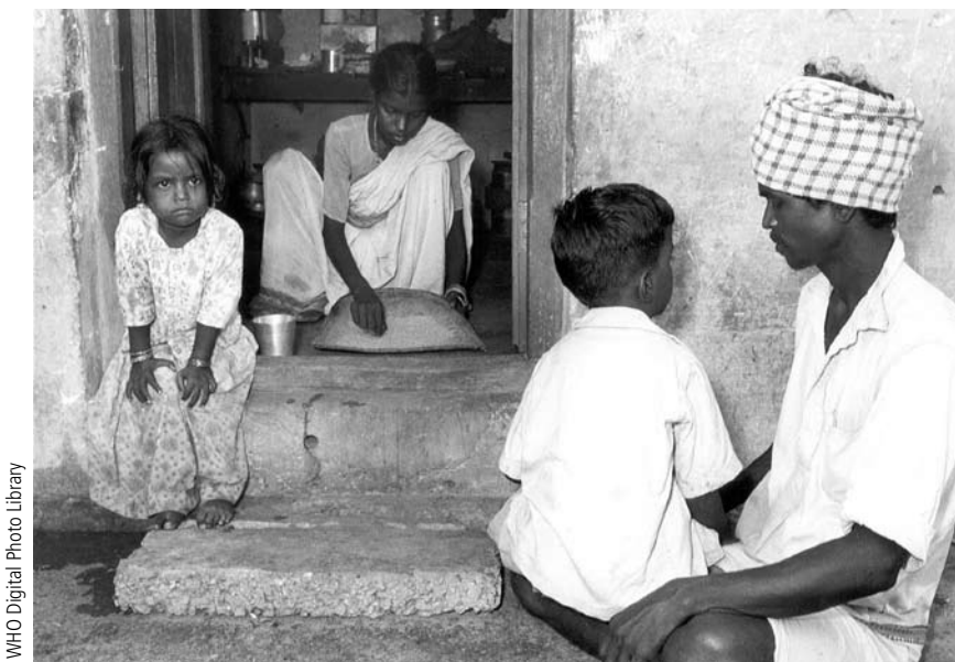
WHO Digital Photo Library

New medicines have transformed the lives of people across the world. With the advent of powerful new anti-tuberculosis drugs in the 1960s, families such as this one in the Indian city of Chennai could be cured at home. Since then, however, no new drugs for the disease have been developed despite growing drug resistance and increasing incidence of tuberculosis in places where the prevalence of HIV/AIDS is high.