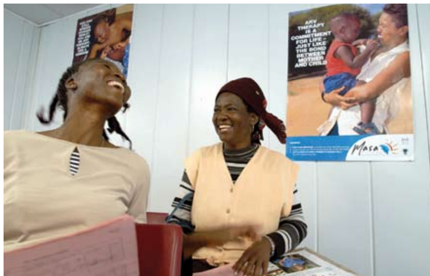
Women in front of a campaign poster that reminds people with HIV/AIDS in Botswana that they must take antiretroviral (ARV) medicines for the rest of their lives. Botswana is one of the few countries in sub-Saharan Africa that provides more than half of its people with HIV/AIDS with life-saving ARV treatment.