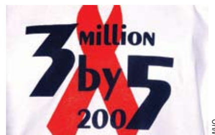
The 3 by 5 campaign has spurred new global momentum to achieve universal access to ARV drugs by 2010.