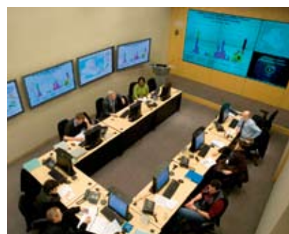
Morning meeting of outbreak review and risk assessment in the SHOC room.

Every weekday morning at 9am about 20 members of that team meet in the Strategic Health Operations